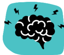
Join this Discussion