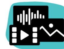
Make & Share