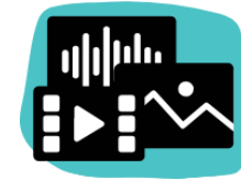
Make & Share