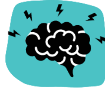
Join this Discussion